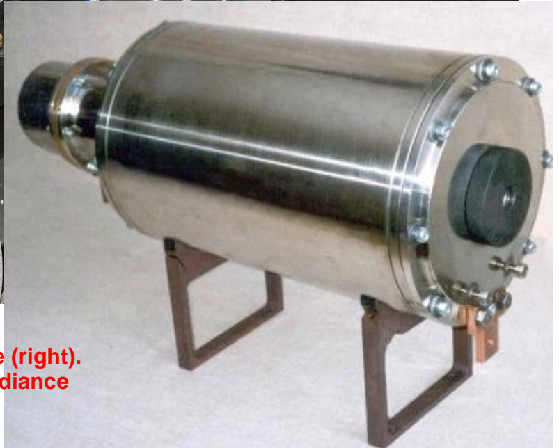
BB3500M-series radiation source (right). Left – BB3500 at the spectral radiance calibration facility.