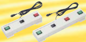
9613 SINGLE-HAND REMOTE CONTROL (option)

Flashes a warning during testing and whenever high voltage is present at the terminals. The DANGER lamp turns off when the voltage at the output terminals is no greater than AC 30 V or DC 60 V.