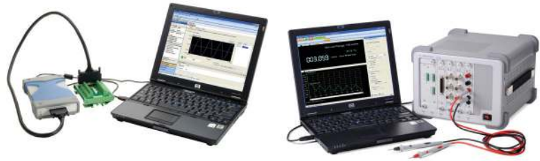
U2741A used as standalone device

The Keysight Technologies U2741A is a 5½-digit digital multimeter (DMM), which is the latest addition to the Keysight's USB modular family. It can operate as standalone or as a modular unit when used with the U2781A USB modular product chassis. It comes with various features and functions to meet your needs today.