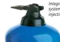
Integrated by-pass : system of turning concentrate injection on and off.

These options allow adapting your Dosatron to your needs. Contact our technical service to help determine what option you may need.