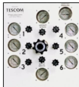
Instrument control panel is easy to access & read