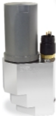
Motorized Cartridge Style Valve