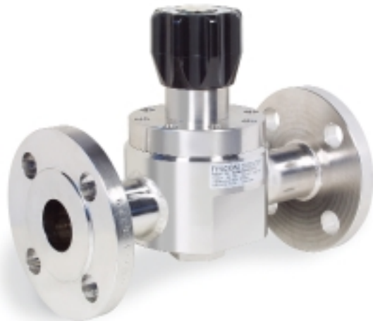
Regulator with welded flanges