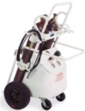
Charger 2 two bottle cart