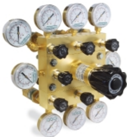
Custom Designed O 2 Manifold