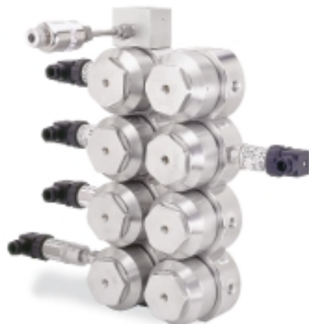
High Pressure Valve Manifold