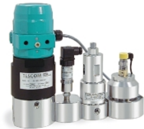
Stackable Pressure Components