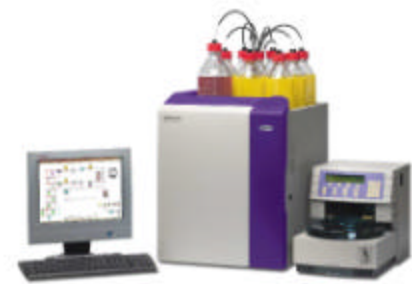
AMINO ACID ANALYZER