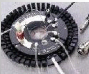
MICROINCUBATOR FOR MICROSCOPES