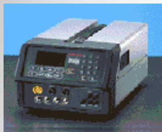
INSPIRA -ADVANCED SAFETY VENTILATOR