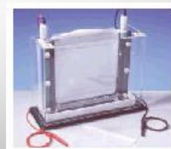
ELECTOPHOREISIS (1D and 2D)