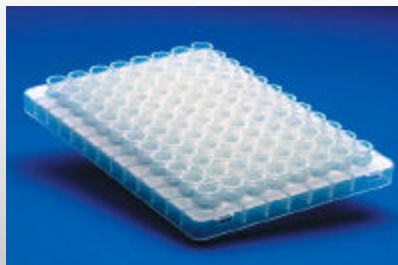
96 WELL EQUILIBRIUM DIALYSIS PLATES FOR BINDING STUDIES