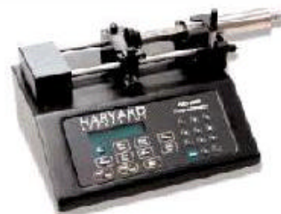
FAMILY OF SYRINGE PUMPS