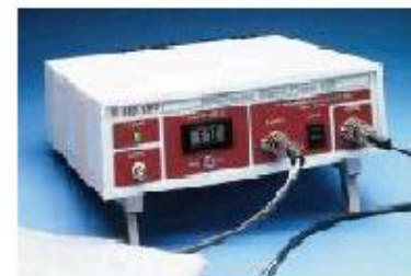
HOMEOTHERMIC BLANKET ...KEEPS ANIMALS AT OPTIMUM TEMPERATURE DURING SURGERY