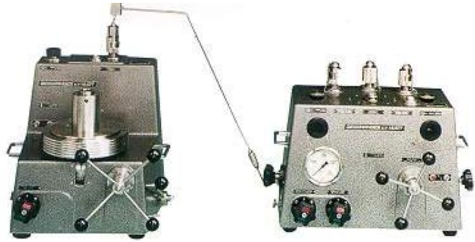
1500 divider with 5300 DH-Budenberg DWT

The Divider model 1500, when combined with an hydraulic pressure standard measures pneumatic differential & gauge pressures from 0 to 10 bar at static pressures between 0 gauge and 400 bar. Any differential pressure increment desired can be performed.