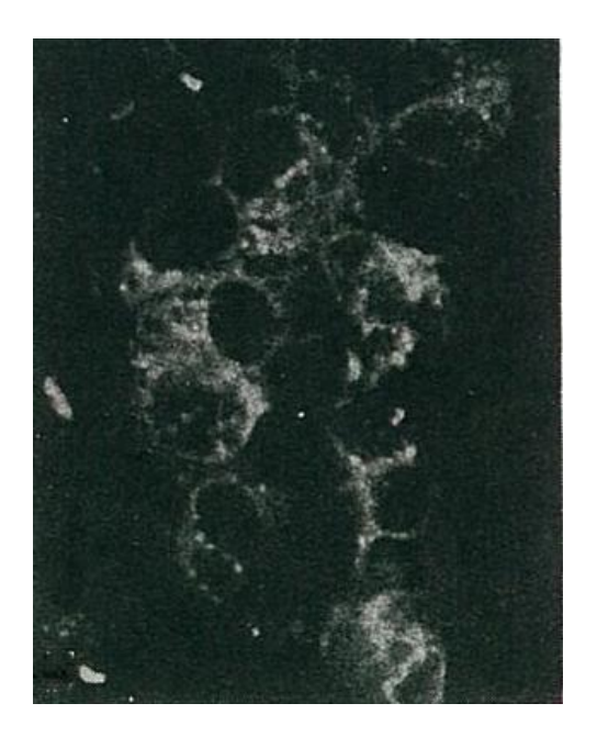
fluorescence antibody staining. Chimp liver cells were infected with recombinant vaccinia virus containing a HCV genome cDNA. After incubation for 48 hr, the cells were fixed with acetone and HCV NS5a protein was detected by indirect immunofluorescence staining using this antibody.

Fig.2 Detection of HCV NS5a protein by immuno-