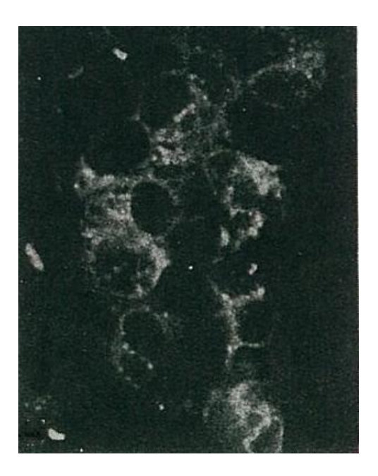
Fig.2 Detection of HCV NS5a protein by immunofluorescence antibody staining.

Chimp liver cells were infected with recombinant vaccinia virus containing a HCV genome cDNA and were subjected to Western blotting using the anti-NS5a antibody. The multitude of NS5a-specific products must be the degraded products of NS5a protein (52 kD).