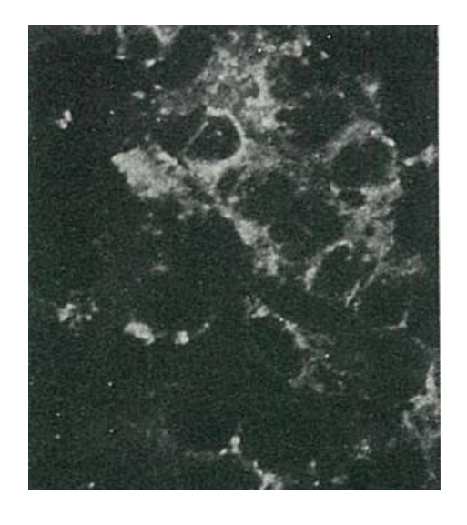
Fig.2 Detection of HCV NS4a protein by immunofluorescence antibody staining. Chimp liver cells were infected with recombinant vaccinia virus containing a HCV genome cDNA. After incubation for 48 hr, the cells were fixed with acetone and HCV NS4a protein was detected by indirect immunofluorescence staining using this antibody.