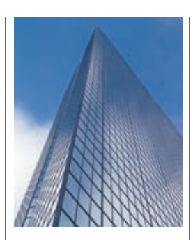
HVAC / Building management