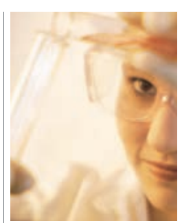
Healthcare, the sciences