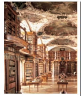
Museums, art galleries

The HygroPalm2-series (with integrated or interchangeable probes) is ideal for all applications where exact measurement of humidity and temperature is of decisive importance, e.g. the food and pharmaceutical industries, printing and paper industries, many trades, the sciences, meteorology, agricultural sector, climatology, etc. There is hardly a field today in which these parameters may be ignored. It is ultimately the measuring task at hand that defines the HygroPalm instrument that best meets your needs.