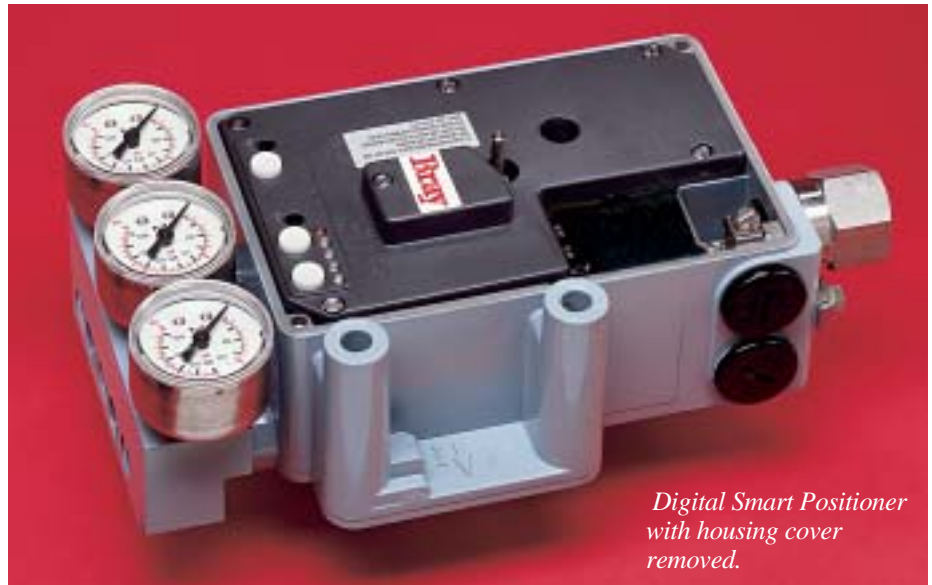
Digital Smart Positioner with housing cover removed.