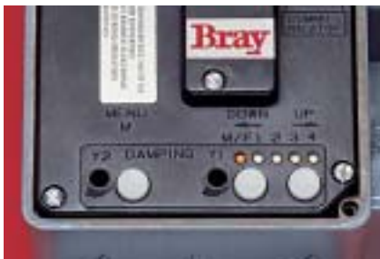
AutoStart Push Button Configuration

Both the BusSmart Positioner and the Digital Positioner feature AutoStart with self-calibration and configuration by means of local push buttons and LEDs. Complicated potentiometer and switch settings are eliminated – configuration is simply a matter of pushing buttons. AutoStart automatically determines the mechanical travel limit stops, records the parameters and continually optimizes control behaviors and travel times bidirectionally by applying and analyzing setpoint jumps. Control behavior parameters are gain, damping and delay on positioning time. These parameters are automatically set for open and close differences and are user adjustable. The settings are then stored in non-volatile memory to prevent loss due to power failure. After performing the AutoStart procedure, the positioner is ready for operation.