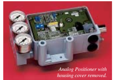
Analog Positioner with housing cover removed.

Other features include travel limit stops, power cut off, split range and characteristic curve functions.