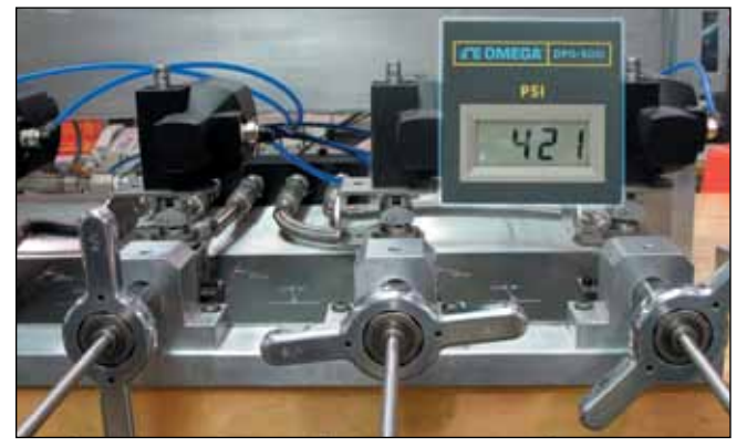
Probes are subjected to a leak test at the welded thermocouple junction (hot end) with a pressurization greater than 2.5 MPa (362 psi).

Programmable controller-based automation used in manufacturing BLMI probes ensures the same high quality from lot to lot—from cutting to final test. After final QA tests for insulation resistance and weld and seal leakage [nitrogen pressure test at 2.5 MPa (362 psi)], OMEGA assigns identification codes to each device, which can be used to track products through the entire manufacturing process.