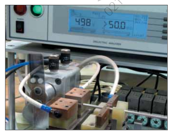
To pass the IR test according to ASTM specs, OMEGA's BLMI probes must achieve at least a 1 G \Omega reading. The unit under test scored 50 G \Omega .

OMEGA's bare leads MI (BLMI) finished probes begin with OMEGA's own high-purity magnesium oxide thermocouple cable. This mineral-insulated, metalsheathed cable uses SLE-class materials throughout its construction.