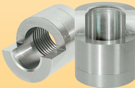
Weld-in sleeve LZE