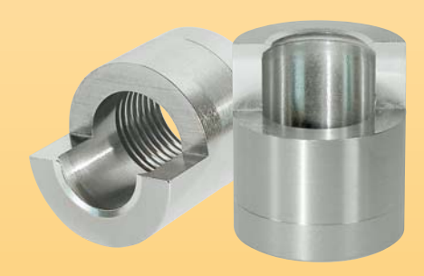
Weld-in sleeve LZE